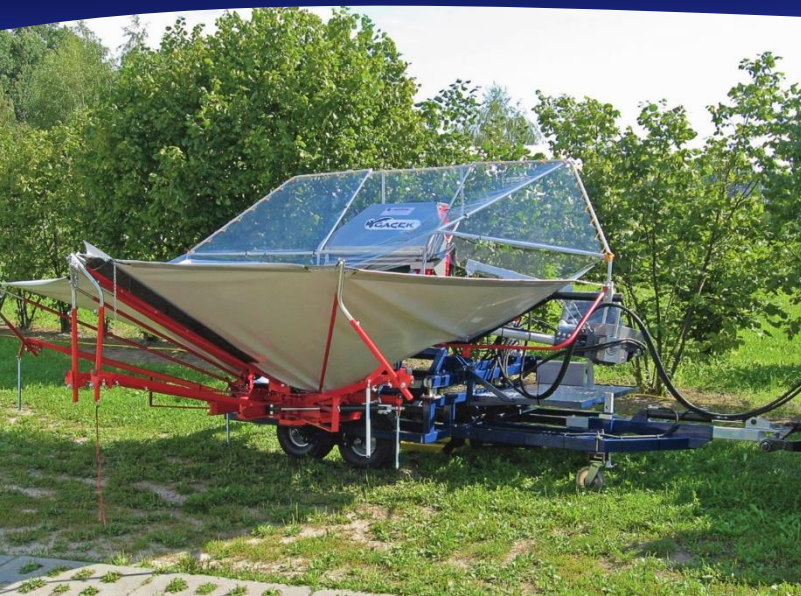
GACEK- STONE FRUIT HARVESTER