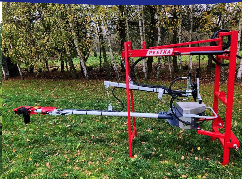
PESTKA- TRUNK TREE SHAKER

Fruits Tree Shaker from JAGODA JPS is intended for harvesting sour-cherries, plums, hazelnuts and industrial apples. It is also successfully used for harvesting olives, almonds and more others.