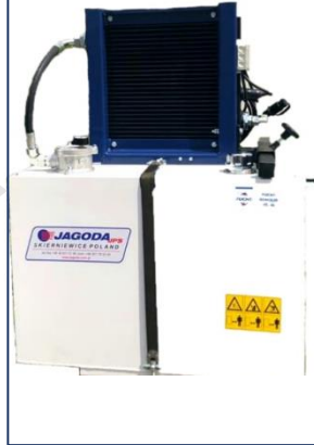
External PTO Hydraulic Pump