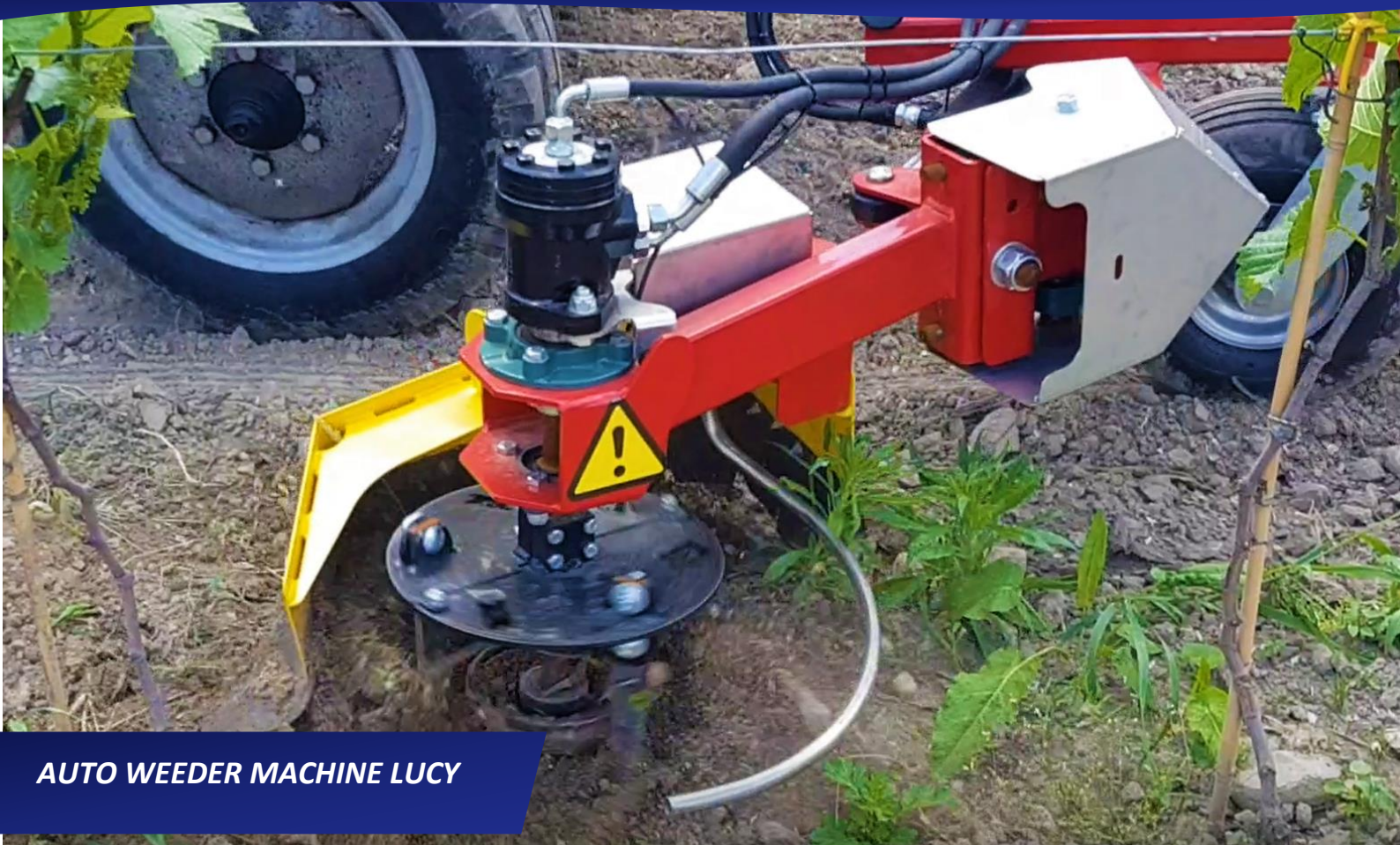
AUTO WEEDER MACHINE LUCY

LUCY – an innovative, hydraulically powered auto weeding machine is intended for destroying weeds in orchards of fruit trees, plantations of berry bushes vineyards and more other. The machine is dedicated for “organic crops” . The use of the weeder allows to reduce significantly or even eliminate the use of herbicides in the fruit production.