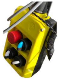
Electric Console Panel