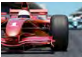
Wheel, clutch, transmission bearings