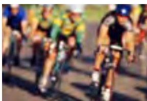
Bicycles, in-line skates