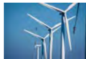
Electric motors and generators