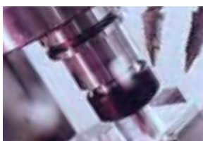
Machine tool spindles