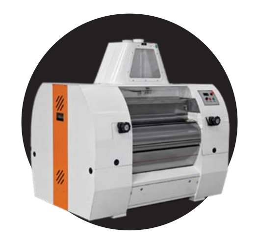
MILLENIUM ROLLER MILL

E & U Foods (Pvt) Ltd plant will utilize this equipment in their milling to produce flour of the highest possible quality. Milleral's products are sold all over the world and their high technology products help the plant to keep up with international standards of milling.