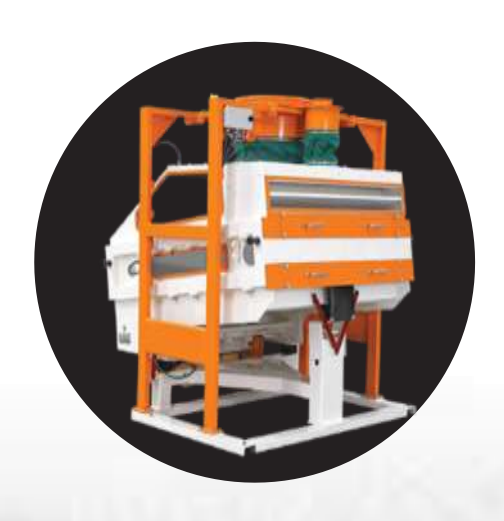
STONE SEPERATOR IMAS