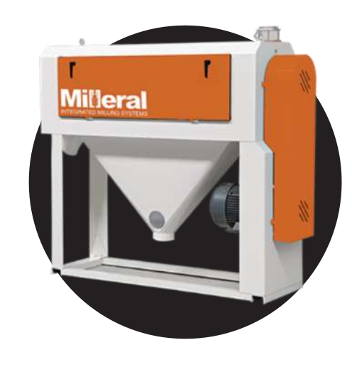
WHEAT IMPACT SOURCER